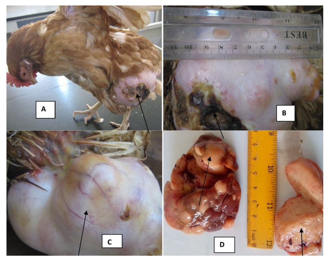
Figure 3. A, B, C-Exotic chicken with traumatized, lobulated large mass (11 cm) on the ventro-lateral surface of the left thigh. D-Deep lipoma and cut surface of deep the lipoma in the liver of a local bird.