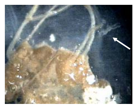
Figure 1. Induction of adventives roots in cucumber leaf tissue cultured in B5 basal medium containing boron and IAA however lacking 2, 4-D.

K. Mashayekhi et al. / International Journal of Plant Production (2008) 2: 163-166