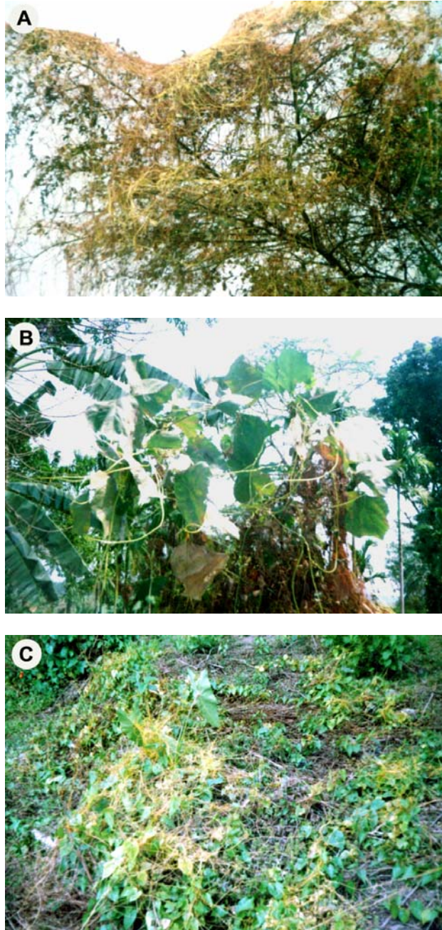
Figure 2. Host plant attacked by Cuscuta reflexa Roxb (A) Ziziphus mauritiana Lamk., (B) Jatropha curcas L., (C) Mikania micrantha (L.) Kunth.